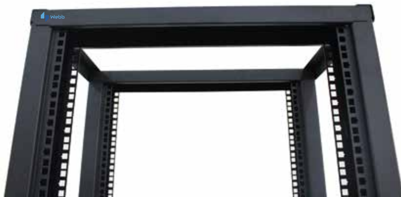
Four-post interior view

*Specifications are subject to change without notice based on technical recommendations and related product enhancements