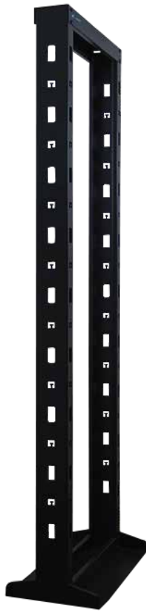
Two-post without castors