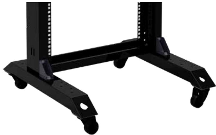
Two-post with castors bottom view

*Specifications are subject to change without notice based on technical recommendations and related product enhancements