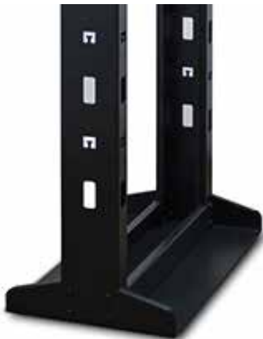
Two-post without castors bottom view