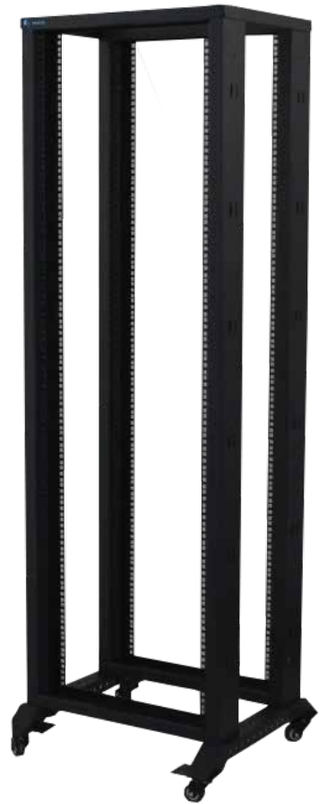
Four-post with castors